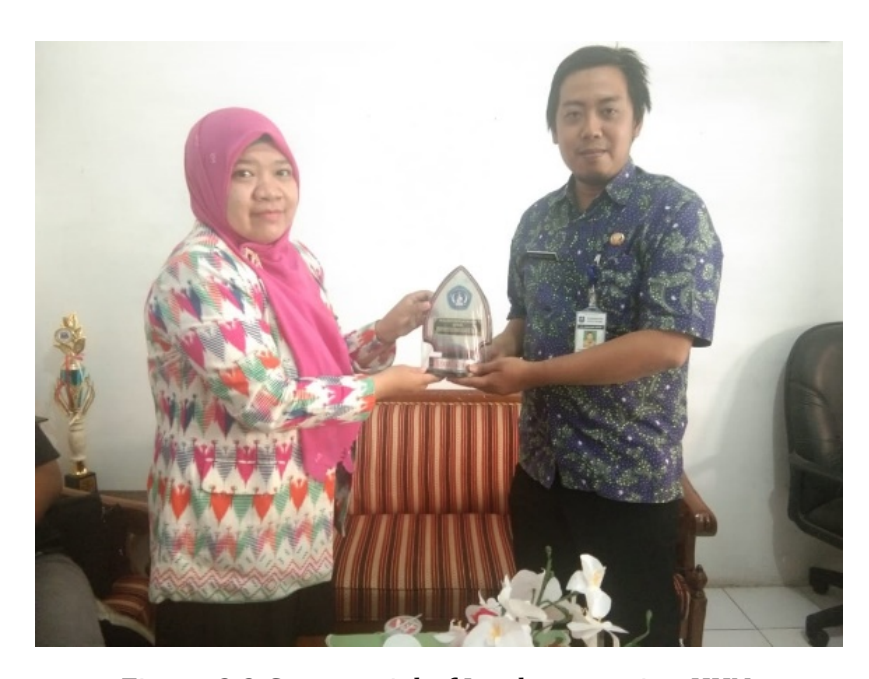
Figure 2.3 Ceremonial of Implementation KKN