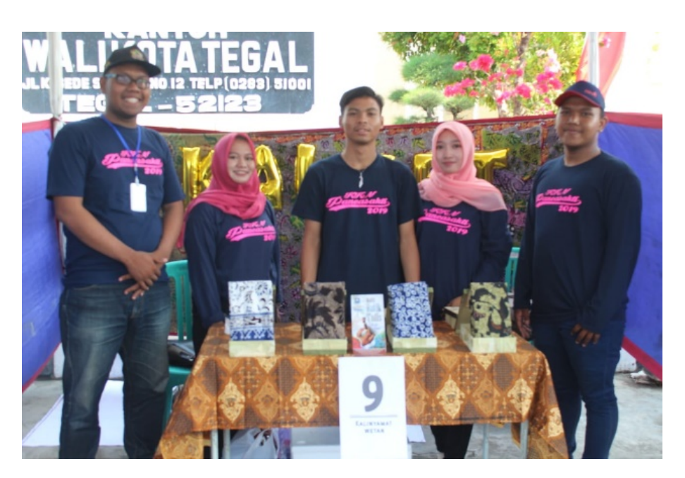
Figure 2.4 KKN Student Kalinyamat Wetan Village