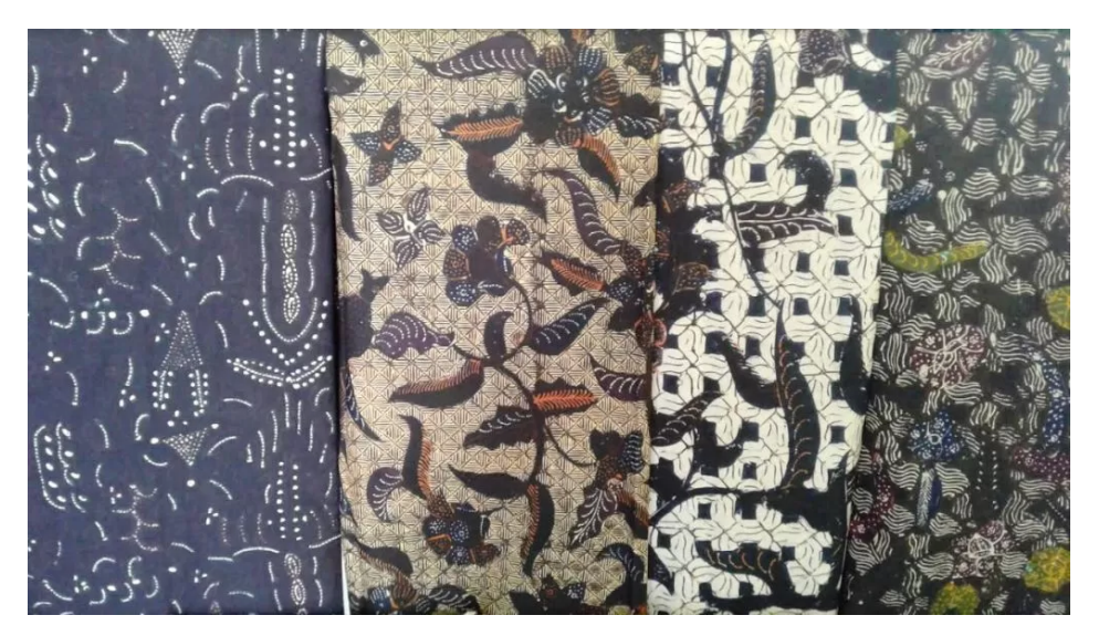
Figure 1.1 Batik Product Kalinyamat Wetan Village

problem of lack of knowledge about innovations in the field of Industry. The level of education is still relatively low in Kalinyamat Wetan which leads to a lack of information and knowledge about the latest innovations to developments in the field of Industry (Eggers et al., 2020).