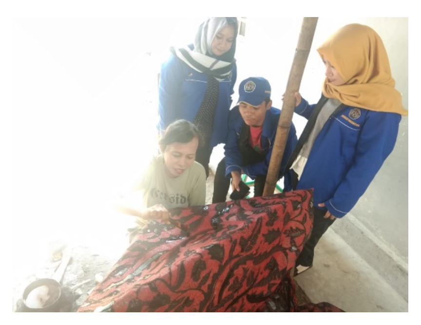
Figure 2.5 The Process of Batik Hand Made