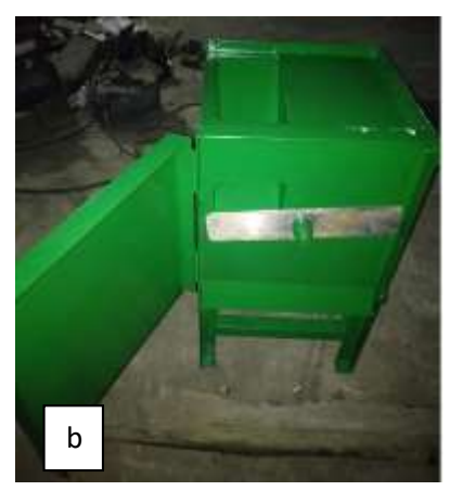
Figure 5.a. Electric and Portable Feed Countering machine (PPEP) (side view); b. Electric and Portable Feed Countering machine (PPEP) (front view).

Installation of Electric and Portable Feed Countering machine (PPEP) at the partner location and training in how to use it is carried out at the time of delivery of the machine to the partner. The machine was handed over to two partners who are cattle farmers in Kebonharjo Village of Palang District of Tuban Regency who have the criteria of maintaining more than 15 cows doing feed enumeration by manual means, namely Mrs. Asih and Mr. Supriyono. Figure 6 shows the Electric and Portable Feed Countering machine (PPEP) and its use training.