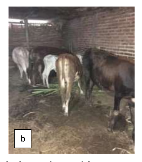
Figure 2 . a. survey of partner locations; b. the condition of the cow pen