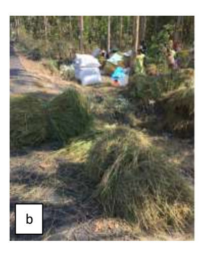
Figure 3 . a. animal feed reserves in partner cages; b. agricultural waste for animal feed in partner environments.